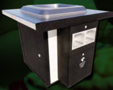
Evolve Barbecue with In-line Hand Sanitiser