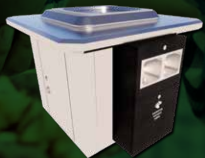
Premium Barbecue with Hand Sanitiser