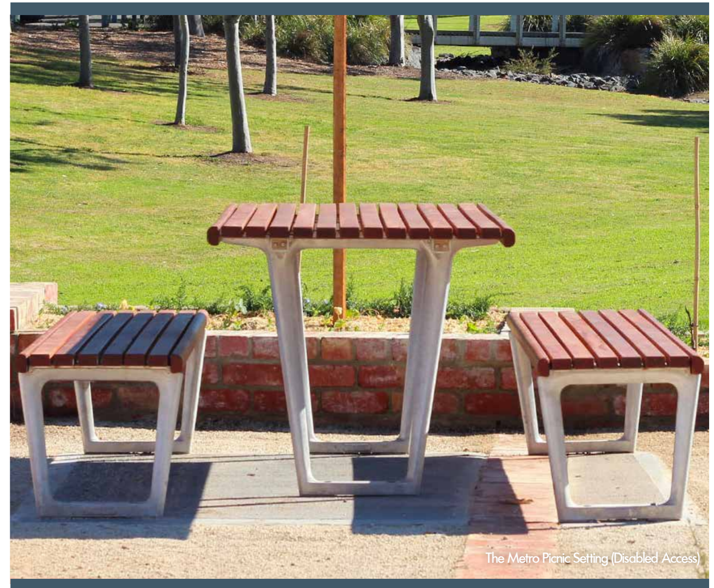
The Metro Picnic Setting (Disabled Access)