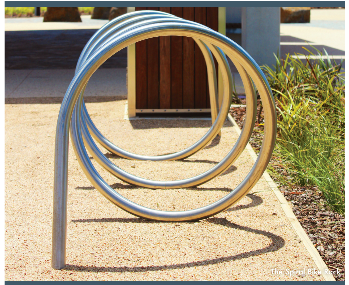
The Spiral Bike Rack